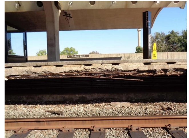
Van Dorn Station