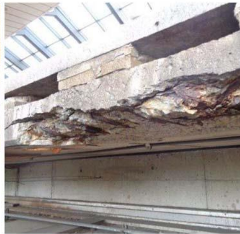
King St Station