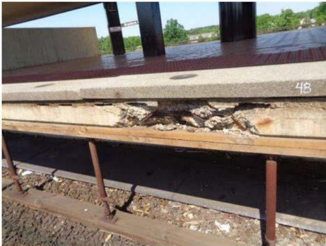
Braddock Road Station