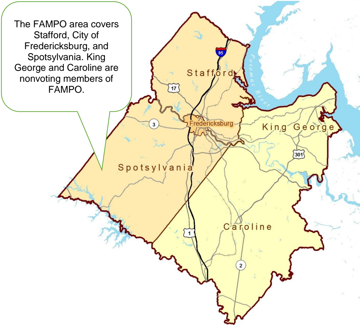
Figure 2 – FAMPO Metropolitan Planning Area for the Fredericksburg Area Region