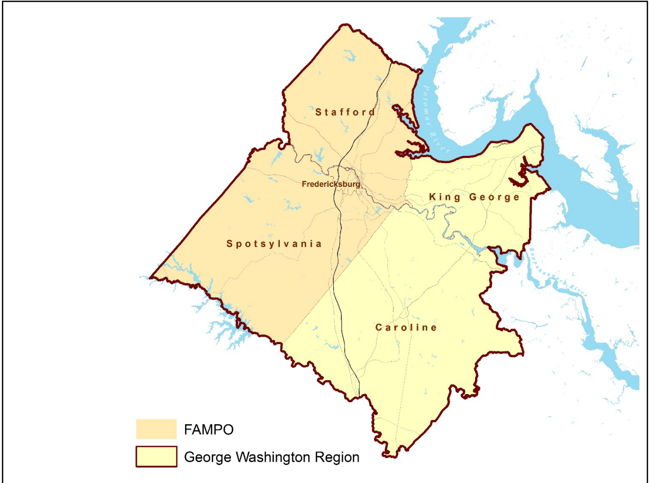
Figure 1. FAMPO and GWRC Planning Areas